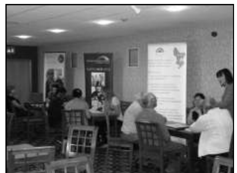
Photographs from the latest Belper Funding Event